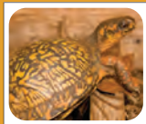
eastern box turtle