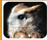
eastern screech owl